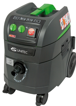
Use with CS 1445 H HEPA Vacuum