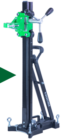
BST 162 H Stand