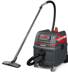
ISC 1625 HEPA Top