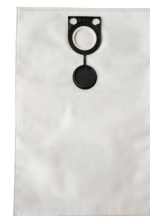
Fleece Filter Bag