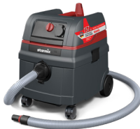
ISC 1625 HEPA Basic