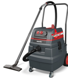
ISC 1650 HEPA Top