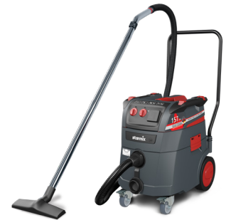
ISP 1635 HEPA Top