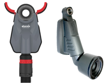
Bohrfixx Dust Collectors