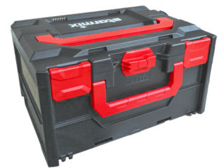
Starbox Storage Box