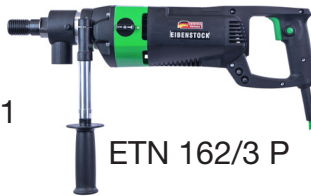
ETN 162/3 P