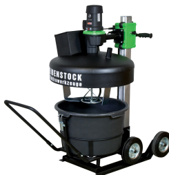
TwinMix 1800 T