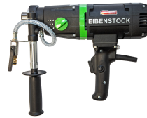
ETN 130/3.2 PO